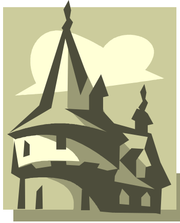
Queen of the castle.

During week two, the Toddlers felt like royalty as they focused on Kings and Queens. The children listened to The Paper-bag Princess and painted t-shirts to go along with the story. The children really enjoyed the dragon! They glued jewels onto a crown and then counted how many they had put on. They also decorated their own castles and glued their pictures inside to be the King or